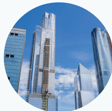
Hudson Yards New York, NY