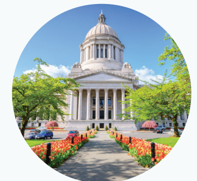
Washington State Capitol Olympia, WA