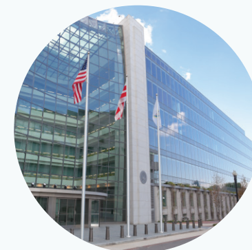
Security & Exchange Commission Washington, D.C.