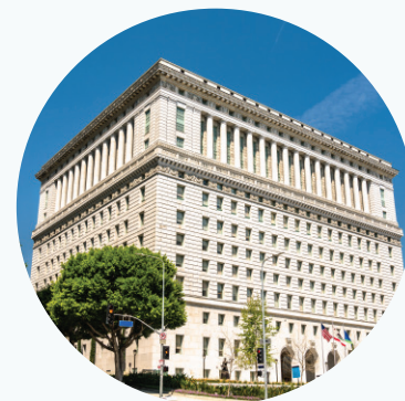
Hall of Justice Los Angeles, CA